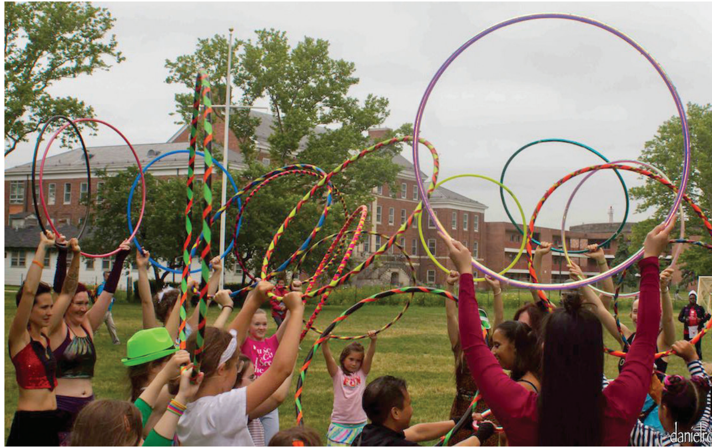
FIGMENT NYC / Photo © 2018 Daniel Rose