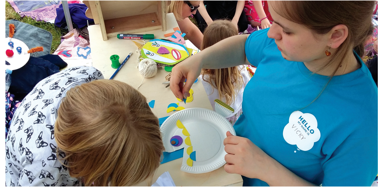
FIGMENT Derby 'On The Road'

Although there was no official FIGMENT Derby event in 2018, the team spent the season prototyping new ideas for FIGMENT Derby with a series of 'on the road' pop-up events at area community festivals. The team used the pop-ups as a way to play with new creations and develop new relationships with artists and communities—especially useful as the civic space that hosts FIGMENT is under development as the new Museum of Making at Derby Silk Mill during 2018–2020.