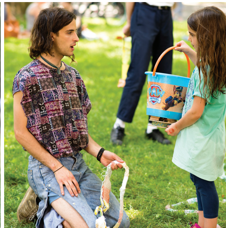
The Dynamic Listening Instrument by Callan Fish. Dream Bigger / Photo © 2018 Adela Wagner