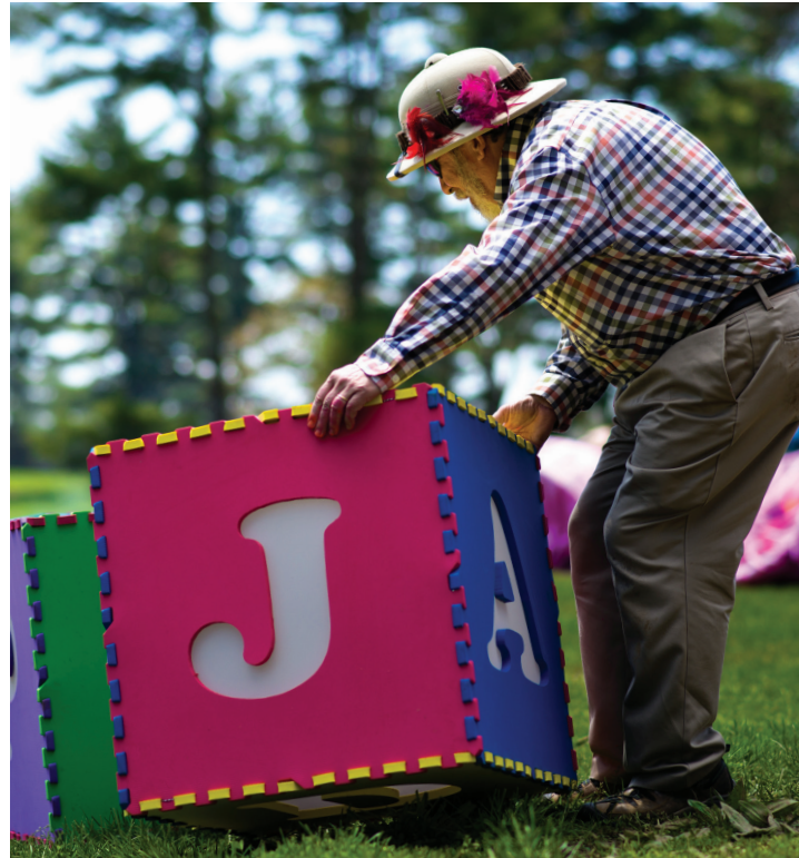
AlphaBlocks by NDWYCO

Our sixth annual ticketed camp-out event for makers, creators, and artists, continued the tradition of celebrating the boldness of creative experimentation. From April 27–29, Camp Ramblewood in Darlington, MD, was a place to launch new art projects, to fail, to improve existing projects, to collaborate, dive in, and create something new, something unexpected. ALPHA is a safe space of community, openness, friendship, invention, and play—equally invested in teaching and learning.