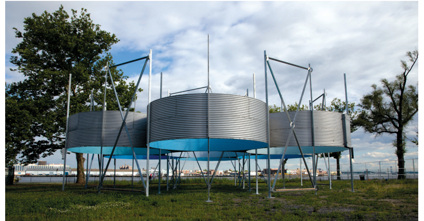
Oculi Pavilion by Austin+Mergold, City of Dreams Pavilion (in collaboration with ENYA and SEAoNY)