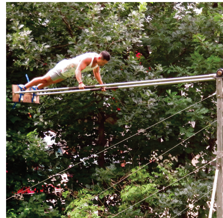
The Moon Shot by Matt Culver