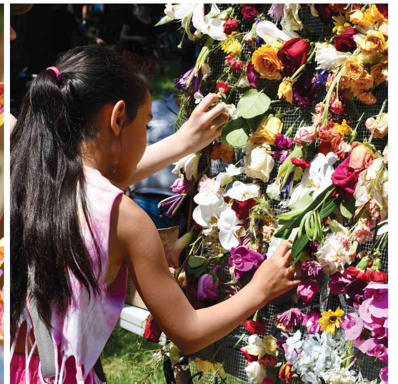
Flower Mosaic by Neal Flowers