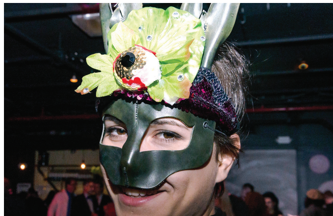
FIGMENT Global Masquerade and Fundraiser

FIGMENT Oakland and Oakland Parks, Recreation & Youth Development developed a second year of free children's summer art classes in Mosswood Park. Says the Oakland team: "Everyone who brings a project to FIGMENT was introduced to creating by someone in their life. We love being part of the community that inspires and encourages that exchange. So we decided to expand our scope, to look beyond our event, and to dig into supporting Oakland, and future Oakland artists, in new ways."