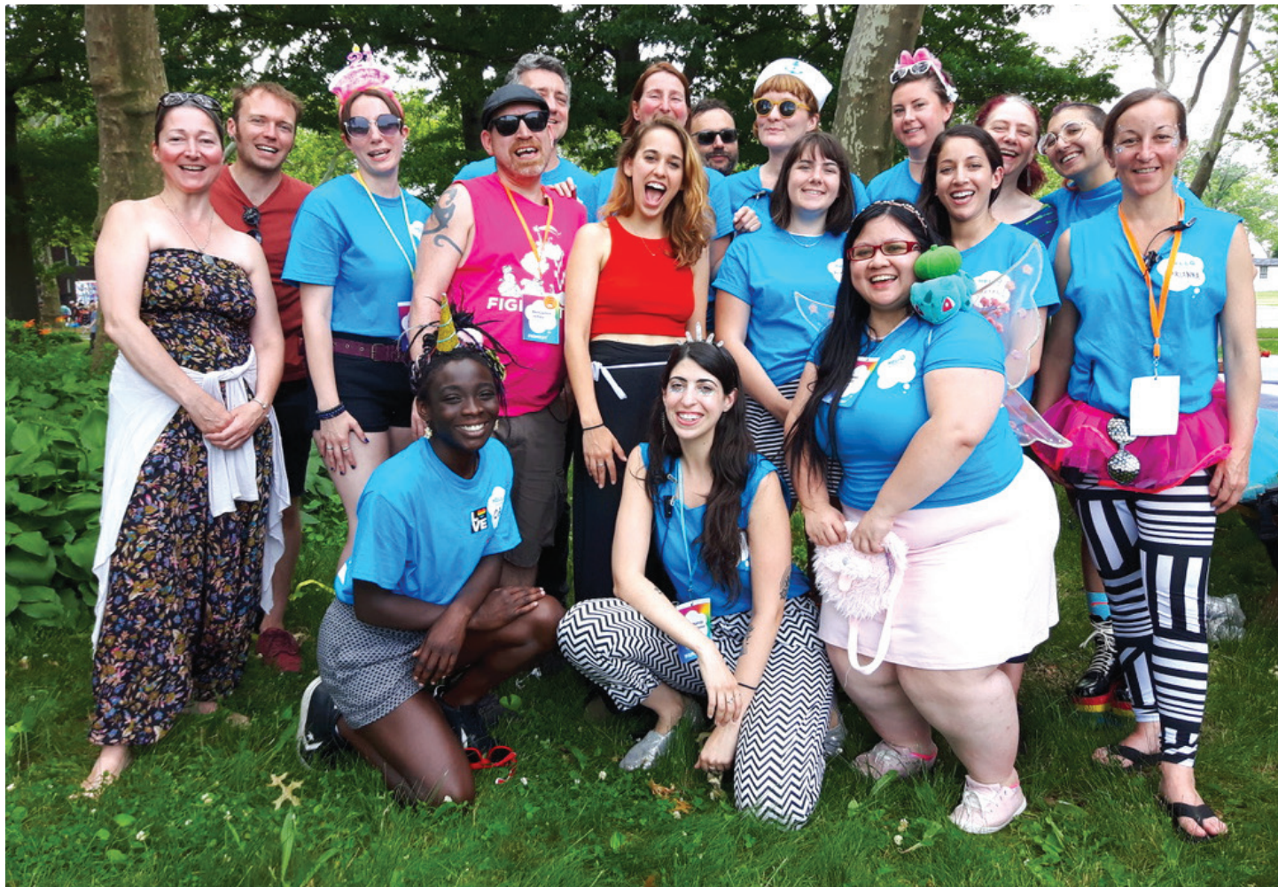
Producers Brunch at FIGMENT NYC