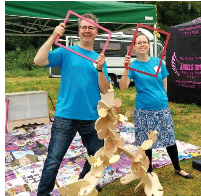
FIGMENT Derby 'On The Road'