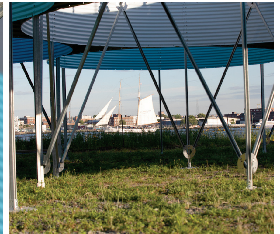
Oculi Pavilion by Austin+Mergold, City of Dreams Pavilion (in collaboration with ENYA and SEAoNY)