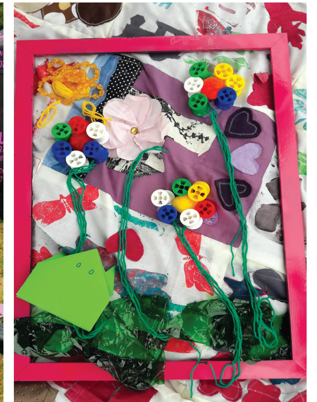
FIGMENT Derby 'On The Road'