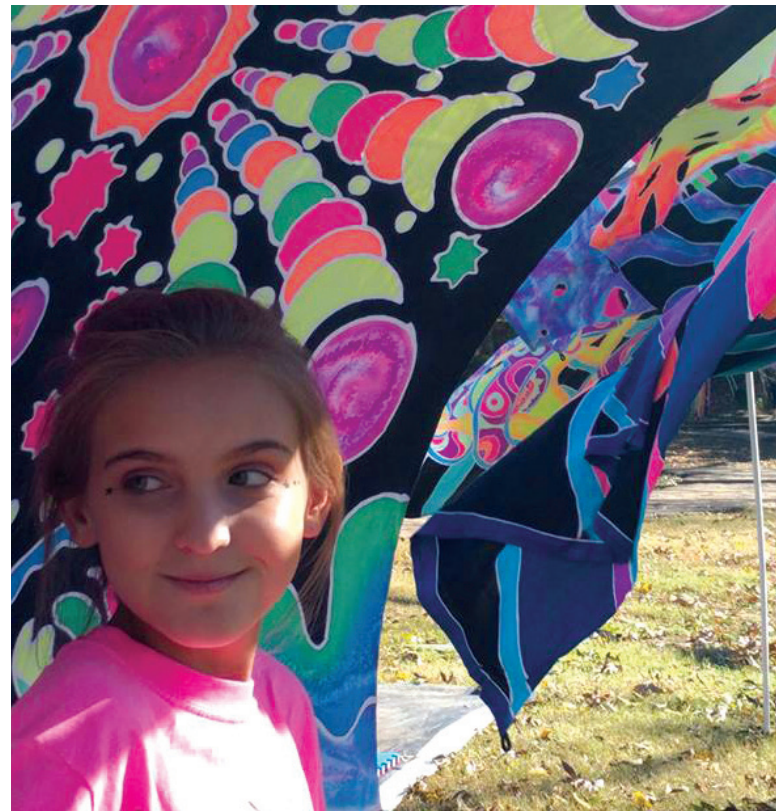
Electric Lotus