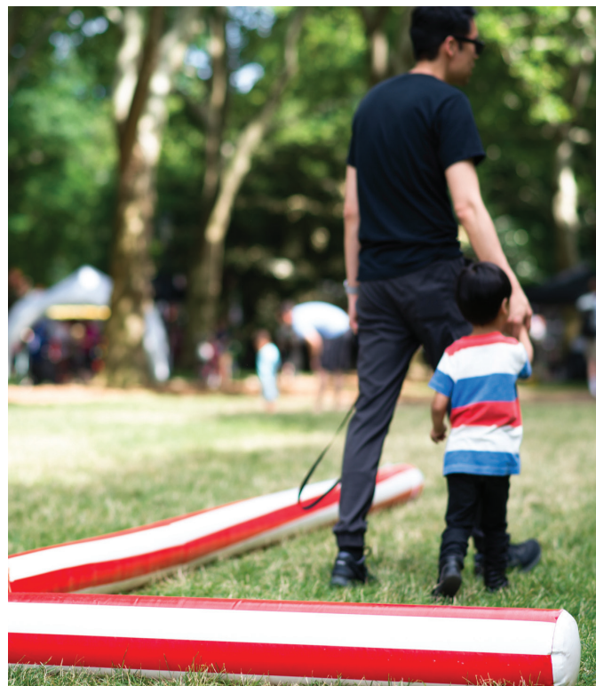
Natural Plasticity by Cruder La Penta / Jane Cruder. Dream Bigger