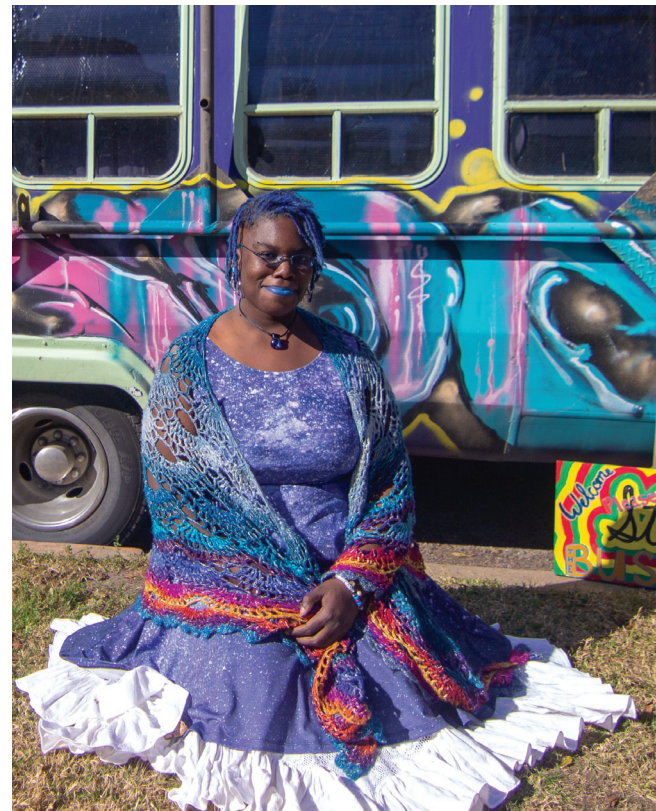
Bustacio Art Bus