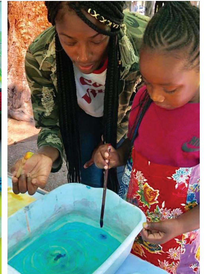
Japanese Paper Marbling by Jess Henricks, FIGMENT Oakland Summer Art Classes / © 2018 Jess Henricks