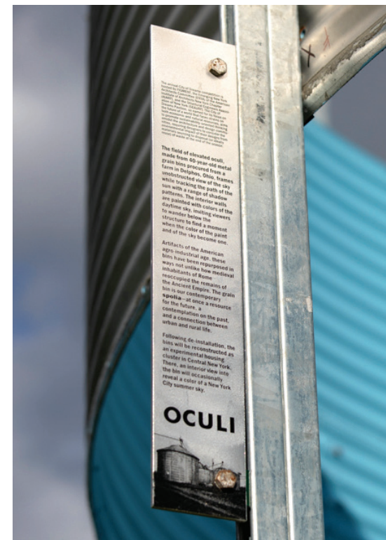
Oculi Pavilion by Austin+Mergold, City of Dreams Pavilion (with ENYA and SEAoNY)