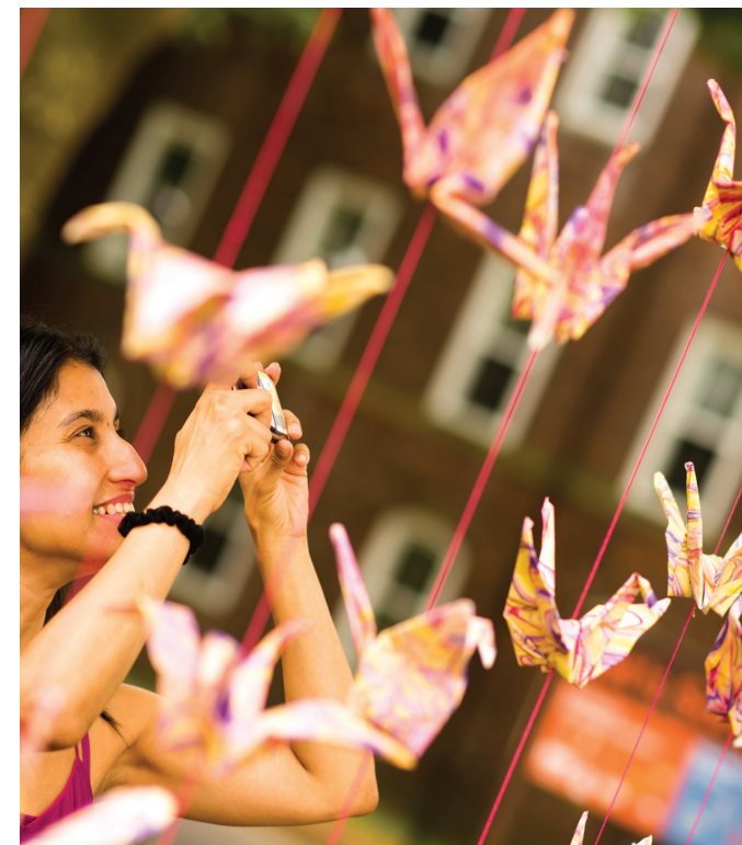
Flights of Fantasy by Helen Chin