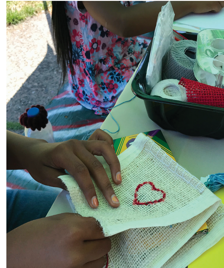
Stitch 'n Draw by Emily Wong, FIGMENT Oakland Summer Art Classes